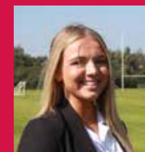
Nya Head Girl