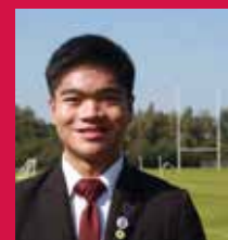
Tennessee Head Boy