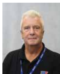
Mr D Cross Site Team